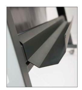
Collecting tray for prints (optional)