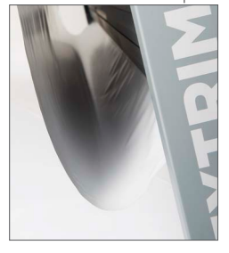
Waste catcher to keep the working area clean and neat