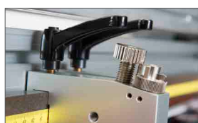
Fine pressure adjustment (according to the types of material)