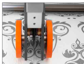
Single lengthwise rotary crush cutter (twin cutters optional)