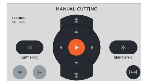
User-friendly software design