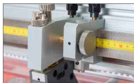
Fine positioning of the cutting blades ( NEW standard)