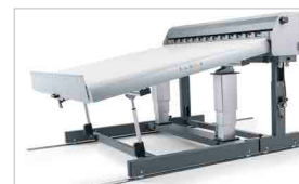
Can be fitted with: (optional):