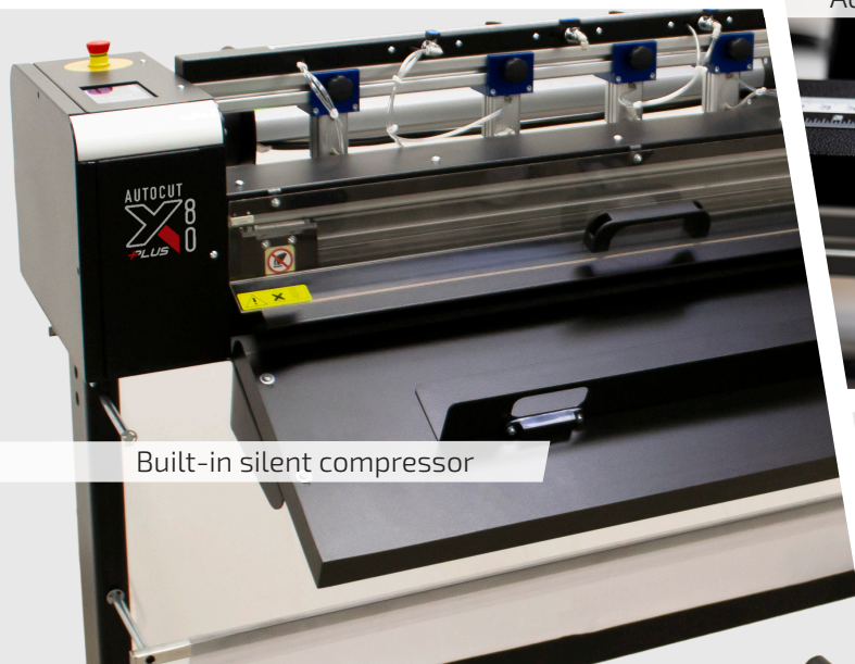
Built-in silent compressor