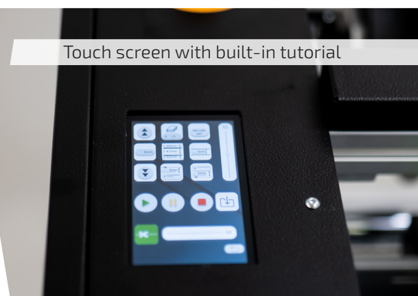
Touch screen with built-in tutorial